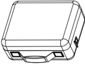
Carrying case (x1)